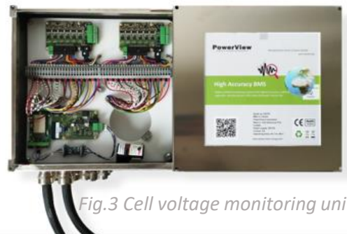
Fig.3 Cell voltage monitoring unit