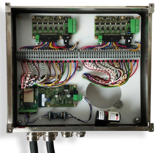
Fig.1 Cell voltage monitoring unit