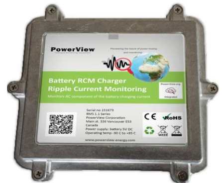
Fig.2 Charger ripple current monitoring